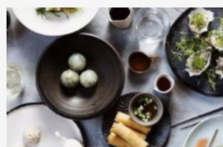
Lotus to open at Sydneys Grosvenor Place