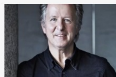
Van Haandel Group sells Stokehouse City premises to