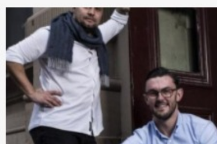
Bouche on Bridge to open this month